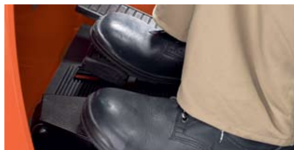
Electronic braking adds to the N-series' driveability