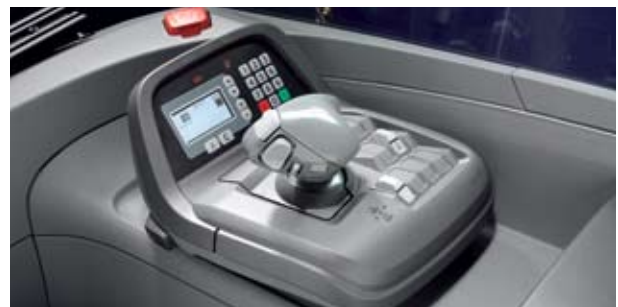
An optional multifunction control unit can be selected, depending on the preference and experience of your drivers