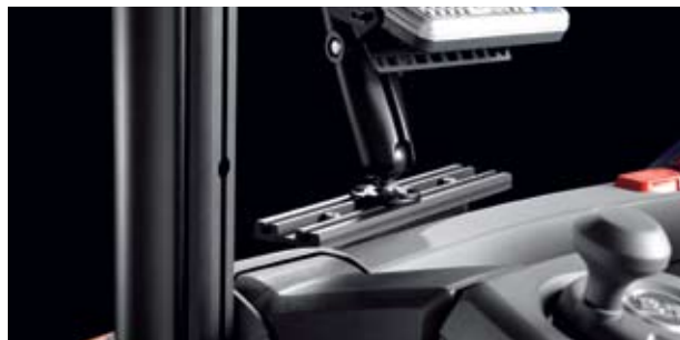
The optional E-bar is designed to carry ancillary equipment, offering standard interfaces and a built-in power supply