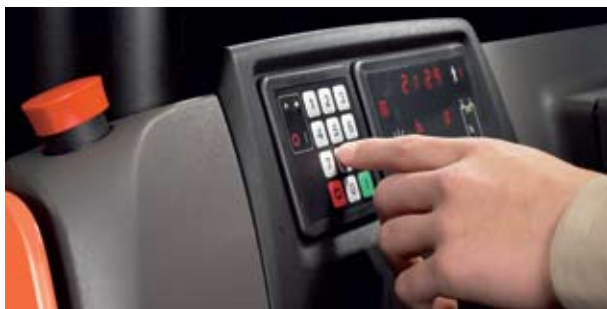
Unique to BT, Reflex M offers PIN-code entry as standard to ensure that the truck is only used by authorised personnel

Pedals are laid out as in a car for maximum ease-of-use, and safety in emergencies. The left foot 'dead-man' pedal sounds a beeper when released, and may be programmed to apply auto-braking. This safety feature directly reduces the risk of left foot injury.