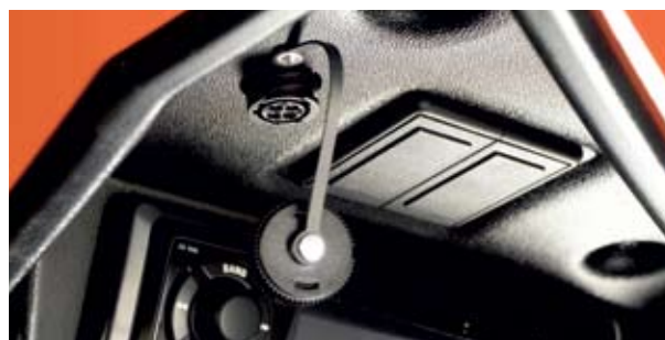
The latest 'CAN' technology also keeps parts to a minimum