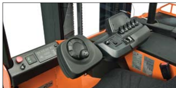
The cabin is spacious and comfortable, and the controls offer fingertip operation, for precise and effort-free load handling