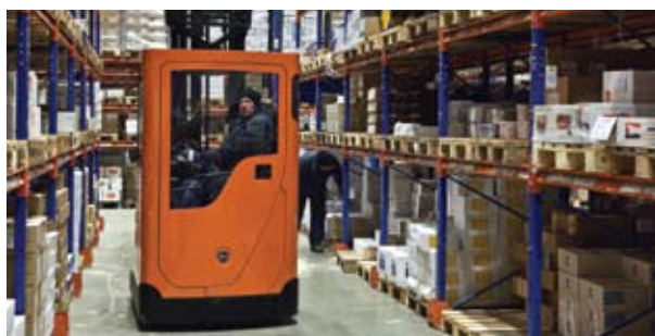
All BT Reflex models can be specified for cold store use