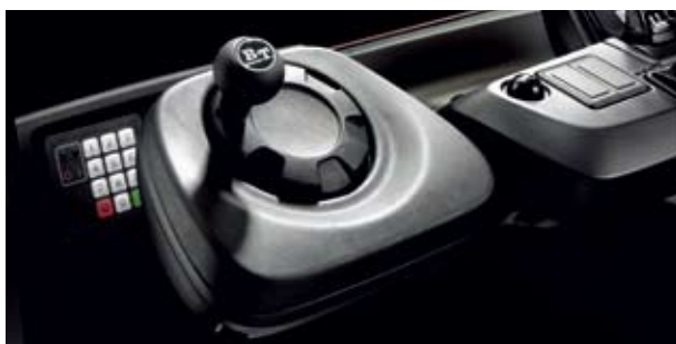
BT Reflex N-series' electronic, progressive 360° steering is perhaps the most significant contribution to the driving experience

'E' stands for efficiency and effective integration with warehouse management systems. The E-bar is a universal mount for warehouse management devices such as on-board computers, radio data terminals, and barcode readers. It can be equipped with an integral 12 V or 24 V DC power supply, ensuring that Reflex M is ready to fit into any application.