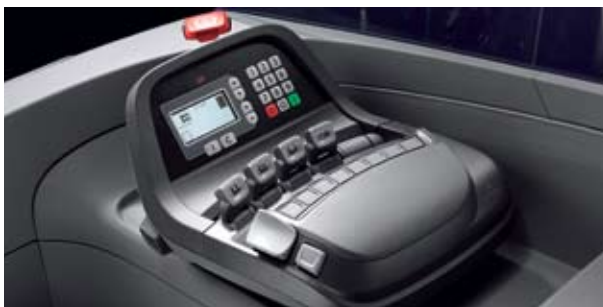
Standard mini-levers allow fingertip control of each fork movement

This option allows frequently accessed lift heights to be pre-programmed for fast and accurate stacking. The pre-selection system differentiates between placement and retrieval cycles, accurately controlling fork movements throughout the process. Information is displayed on the load information display, which also shows lift height and load weight.