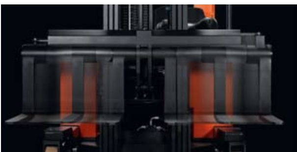
The BT Reflex F-series can spread its forks over a range of 0.54 m to 2.22 m

Maximum lift height is 8 m, load capacity 2700 kg.