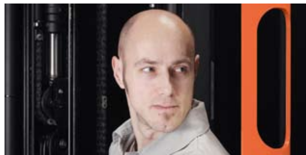
The design of the cab not only provides panoramic vision for the operator, but also provides excellent protection – the operator is fully contained within the profile of the cab