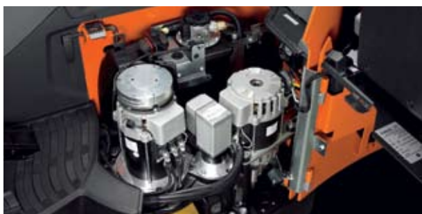
BT Reflex R-series has durability designed-in with its sealed electrical units, brushless motors and leak-free connectors

Routine servicing and safety checks are of course essential. It is also important to keep time lost to servicing to the absolute minimum. The latest generation of BT Reflex reach trucks has extended service intervals due to the use of long-life or maintenance-free components. On-board diagnostics can quickly pinpoint any faults as they occur and ensure that remedial action is fast and effective. This is further supported by exceptionally easy service access to all areas of the truck.