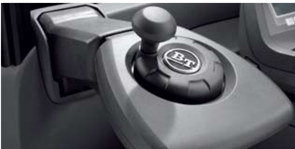
The advanced 360° steering system on all BT Reflex trucks allows exceptional manoeuvrability

BT Reflex trucks are powered by AC motors, which ensure maximum energy efficiency. Consumption rates are low on all BT Reflex models, with the added benefit of energy being recycled on deceleration and braking. For multi-shift operations these trucks can interface with battery change systems and the battery can be quickly and easily power-released while the driver is seated in the cab.