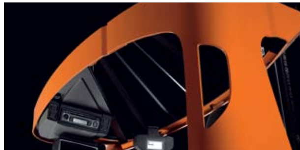
BT carefully considered all aspects of visibility during the design process

The driver console is low and slopes away from the driver. This gives maximum forward visibility from the cab when manoeuvring in congested areas.