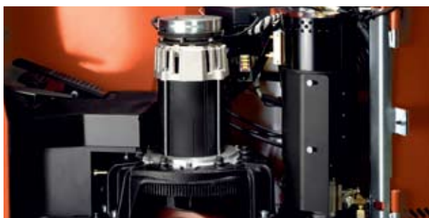
The absence of carbon brushes and power contacts in its AC drive motor reduces maintenance downtime